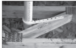
Locking finger allows installation at all angles.