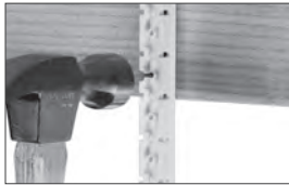
Opposing holes are 1/2" on center.