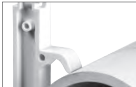
Locking finger holds pipe in place.