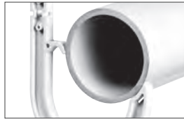
Cradles pipe before final installation.