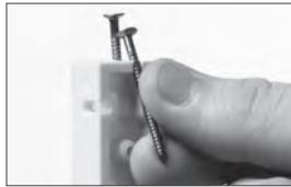
Two nails supplied for easy installation.